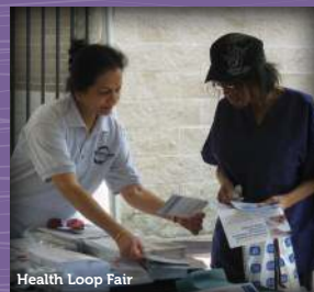
Health Loop Fair