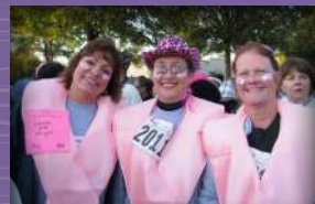
Race For the Cure

Regional Medical Center is proud to partner with and support a wide array of community endeavors that strengthen and improve the overall health and wellness of the residents in the Mid-South. Through free health fairs, sponsorships, education opportunities and wellness events, Regional Medical Center is helping to shape a healthier future for this community.