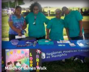
March of Dimes Walk