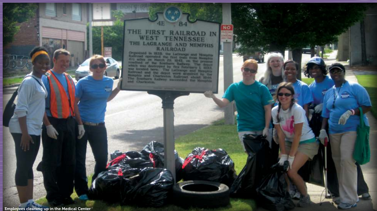
Employees cleaning up in the Medical Center

Regional Medical Center plays an active role in the health of our community through corporate sponsorships with organizations such as March of Dimes and the American Heart Association. Also, the system's involvement with Healthy Shelby, Triple Aim Project and Memphis Tomorrow is helping to ensure a healthier tomorrow for our community.